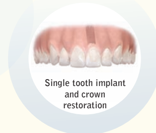
Single tooth implant and crown restoration