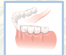
Final crown and bridge restoration