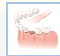
Preparation of adjacent teeth